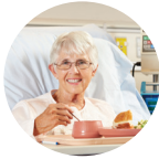
Are of older age