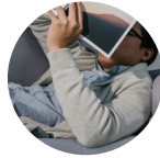
Have low levels of activity or movement