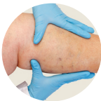
Have had a blood clot before