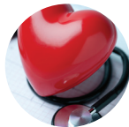
Have heart problems such as heart failure

If any of these describe you, talk to your specialist, doctor or nurse about what you can do to reduce your risk. Keep reading the rest of this booklet for tips on reducing your risk. 2