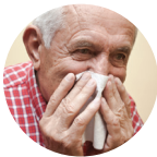
Hospitalisation for illness or surgery